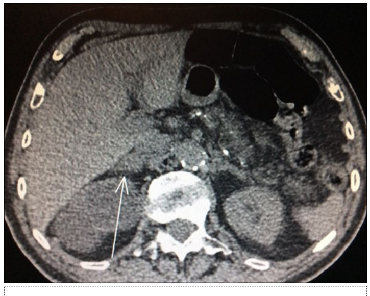
Figure 1. CT scan showing isolated right adrenal NSLC metastasis (Arrow)