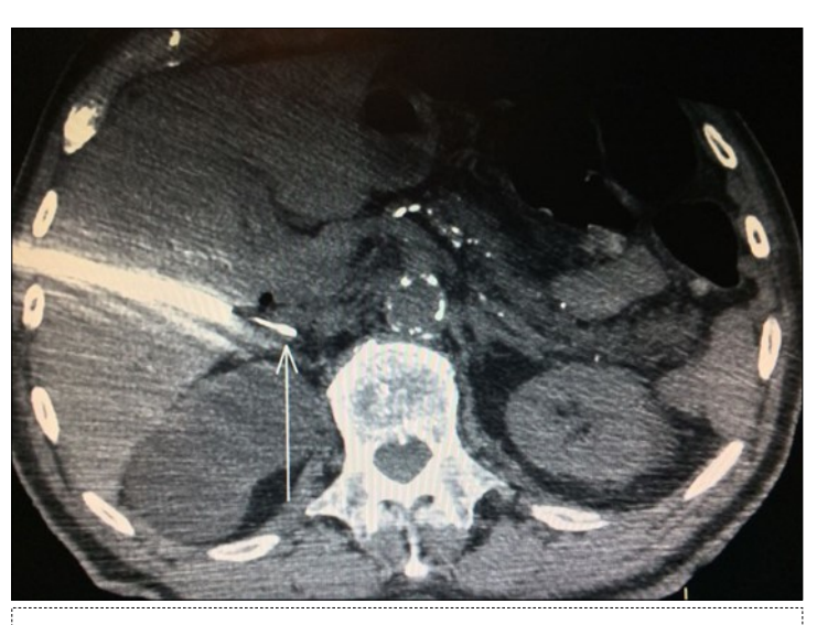
Figure 3. Right adrenal needle biopsy (arrow)