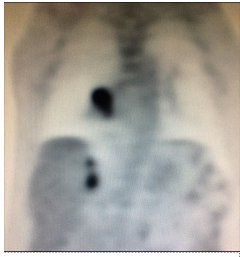
Figure 4. PET CT showing simultaneous uptake on right lung mass and 2 ipsilateral adrenal nodules.