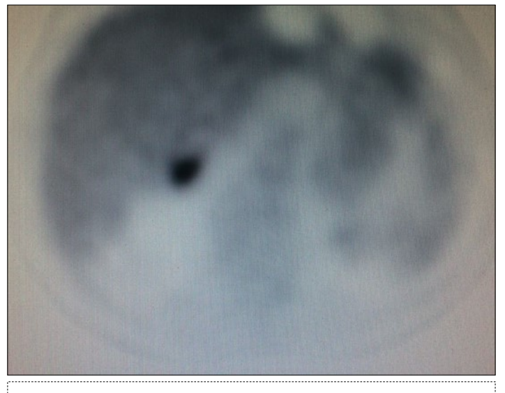
Figure 2. PET-CT with high uptake on right adrenal