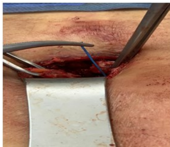
Figure 2. One of the offending pacing wires found adjacent to back of the xyphoid process. It is held with forceps.