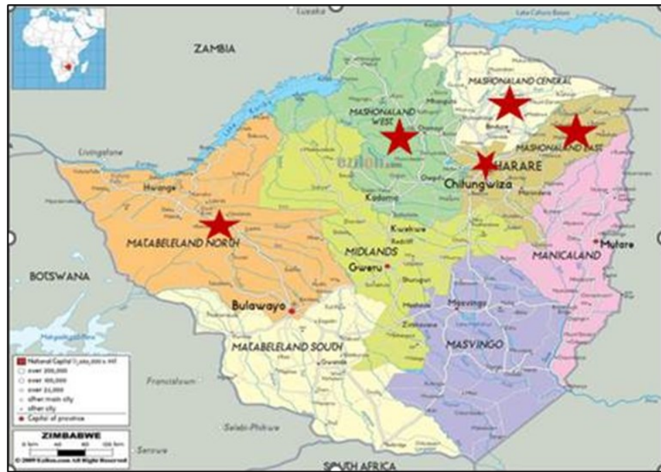
Figure 1. Map of Zimbabwe with the five provinces with interventions highlighted.

ing IPC indicators wherever possible. Risk assessments were conducted at the start of the project and during two subsequent follow-up visits, and the results were reported to District and Provincial Health Executives.